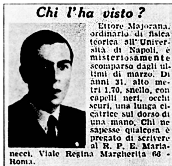
Advertisement by the family Majorana in an Italian newspaper from 1938, asking for information after Ettore had mysteriously disappeared.

An interesting case was Ettore Majorana, a brilliant young Italian nuclear physicist, who mysteriously disappeared in 1938 from a boat near Sicily. There have been — and still are — wide-spread doubts about the official version of a suicide; rumors claim that he hid in a monastery, or fled to Argentina. Mussolini's troops searched for him — unsuccessfully — in monasteries, assuming that he could be useful for military projects (in the same year, Enrico Fermi had defected to the USA). We still don't know what really happened to Majorana, and if his disappearance was related to worries about the dangers of nuclear technology, in particular in the hands of a fascist regime.