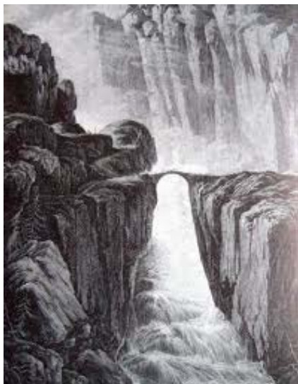
Drawing of the historic Devil's Bridge in the Swiss Alps.

The message of this legend is that technology can facilitate our life a lot, but this is not for free: it comes with a price, symbolized by a “ pact with the devil ”. There are risks attached to it, which can be hard to control; nuclear centers could be a modern analogue. Here we comment on the impact of science and technology on society, and on the responsibility if something goes wrong. In general the problem cannot be solved as easily as it was the case in medieval Uri.